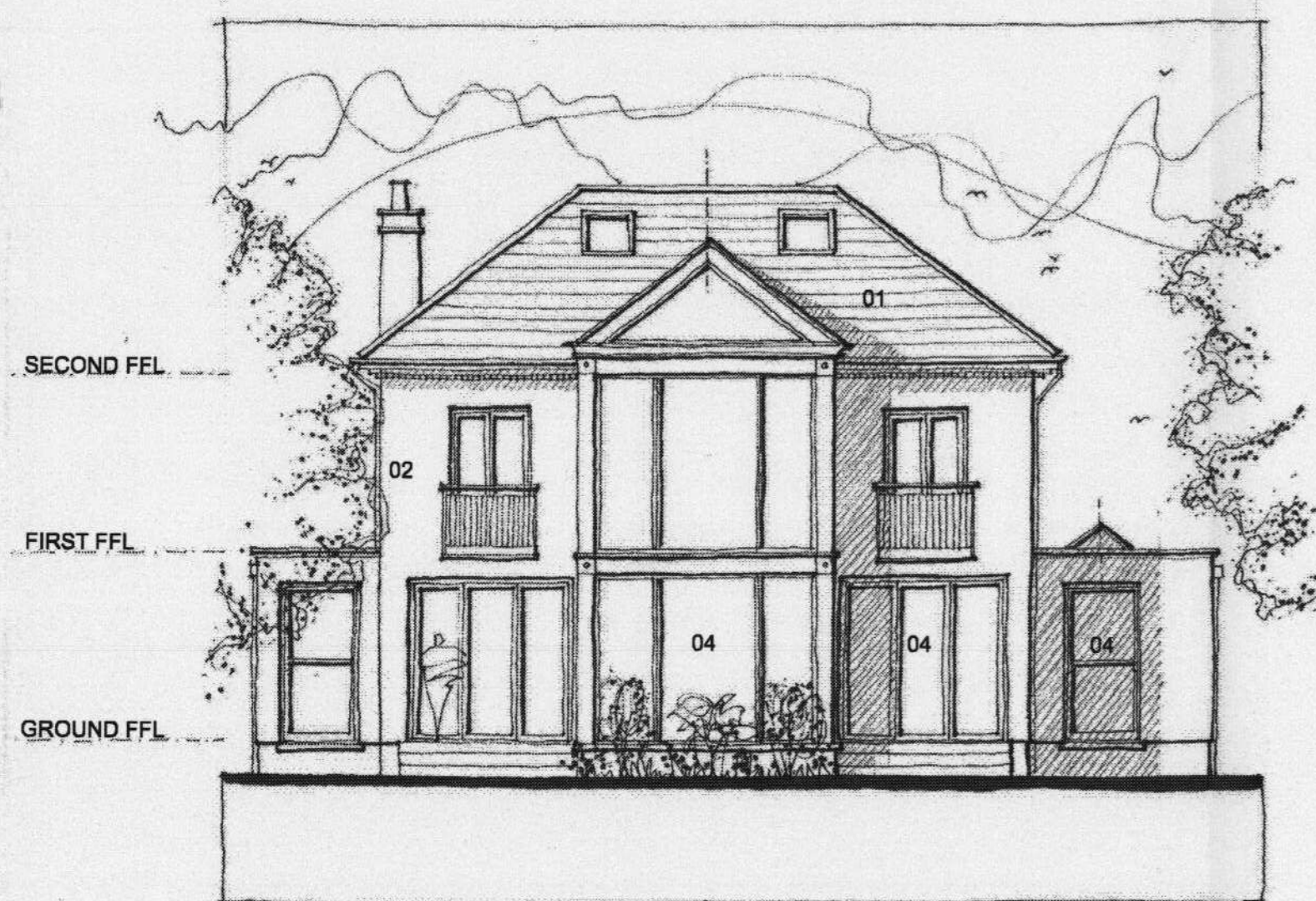
PROPOSED ELEVATION - RIVER THAMES FRONT SCALE 1:100 @ A2