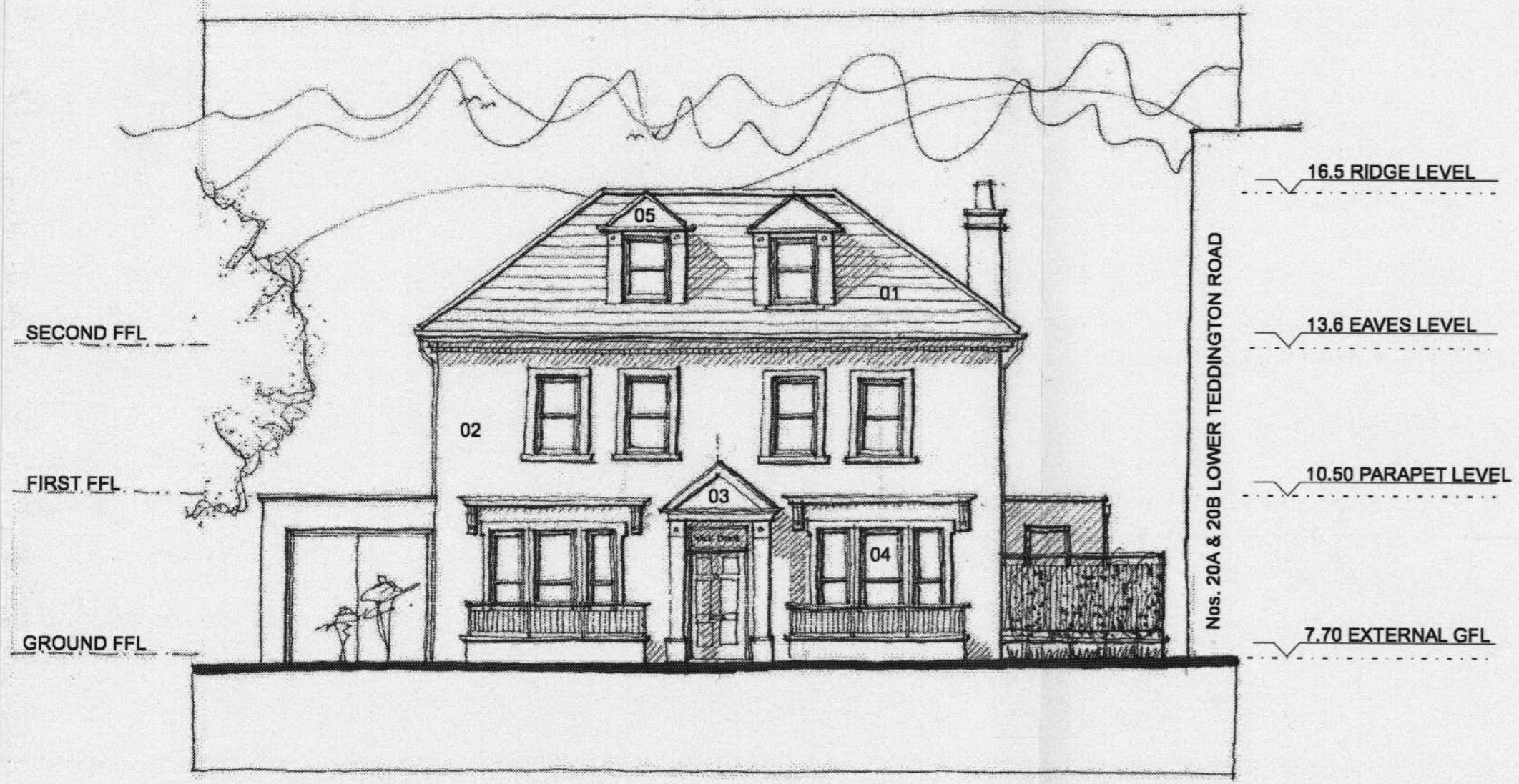
PROPOSED ELEVATION - LOWER TEDDINGTON ROAD SCALE 1:100 @ A2